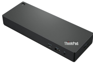
ThinkPad Universal Thunderbolt™ 4 Dock