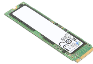
ThinkPad 1TB PCIe NVMe OPAL2 M.2 2280 SSD