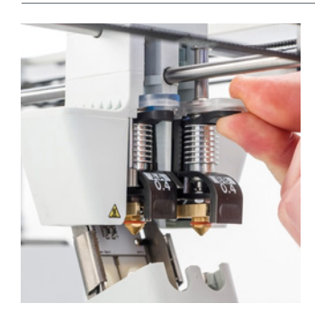
Print core AA 0.25, 0.4, 0.8 mm Quick-swap nozzles minimize downtime