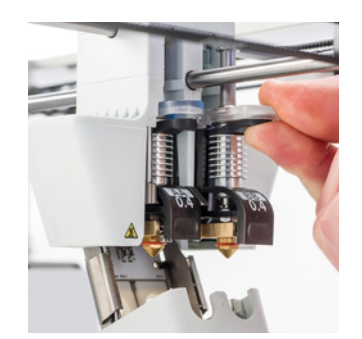
Print core BB 0.4, 0.8 mm Specially designed for printing soluble support material