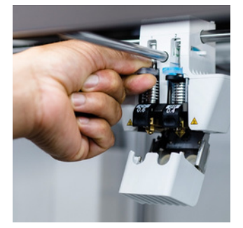
Print core CC 0.6 mm Ruby-tipped for printing abrasive composites