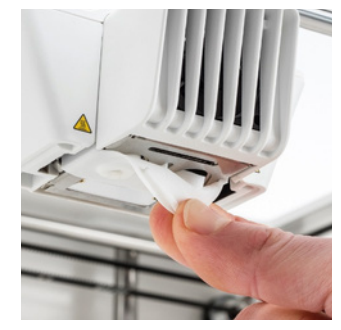
Nozzle covers x10 Replacement covers keep your print head in top condition